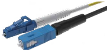
Fusion Splice-On Connector(FSOC)