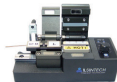
ITS-12 Thermal Stripper