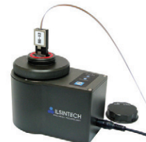
IFC-24 Ultrasonic Cleaner

ILSINTECH Fiber Optic Solution: Miscellaneous Category: V-Groove Fiber Alignment